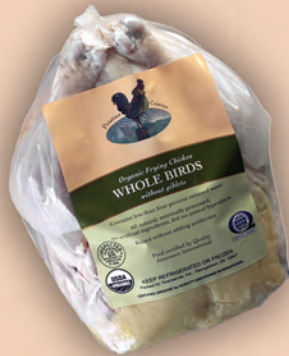
Individually Bagged Whole Birds