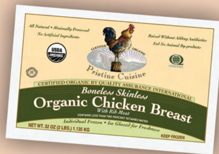
Individually Frozen Retail Bags